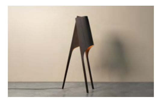
Promontory Refractory refractory.studio

Founded by designers Angie West and Alberto Vélez during the pandemic, Refractory's inaugural collection includes consoles, dining tables, occasional tables, benches, and lighting rendered from cast bronze, cast glass, solid black walnut, white oak, and cast resin. The collection's muted, deep palette of patinas evokes natural phenomena and earthen pigments. Included in the line is the 68-in-high Promontory Standing Lamp, a biomorphic light in which two asymmetrical halves of sculptural cast bronze lean into one another.