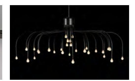
Starfall Light Moooi moooi.com

Using high-efficiency LED lights, Acoustic Stratta is LightArt's slimmest acoustic lighting fixture to date. Imagined for high-traffic commercial spaces, the fixture can be specified individually or in a row through minimal, linkable components. The LED platform includes warm dimming and tunable white and RGBW options in uplight and downlight capabilities to create different moods. The collection offers a premium aluminum structure and sound absorption up to two times more absorbent than previous iterations. It is available in 22 felt colors with optional ash or oak wood caps.