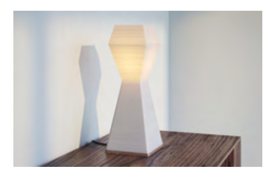
Eos Collection Model No. model-no.com/lighting

Founded by designers Angie West and Alberto Vélez during the pandemic, Refractory's inaugural collection includes consoles, dining tables, occasional tables, benches, and lighting rendered from cast bronze, cast glass, solid black walnut, white oak, and cast resin. The collection's muted, deep palette of patinas evokes natural phenomena and earthen pigments. Included in the line is the 68-in-high Promontory Standing Lamp, a biomorphic light in which two asymmetrical halves of sculptural cast bronze lean into one another.