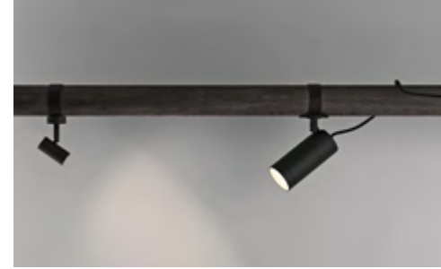
Rocchetto Tree Quick Lighting qu-lighting.com

Model No. has launched a 3D-printed lighting collection crafted from non-toxic, domestically sourced materials including sustainable hardwood and PLA bioresins from food waste and wood dust. Every Model No. piece is made to order in the company's Oakland, California, microfactory, which helps eliminate long wait times and wasteful inventory. The collection includes table lamps, pendants, and a floor lamp that can work individually or as part of a group. The luminaires have a natural translucency and opacity that spreads a soft, even light.