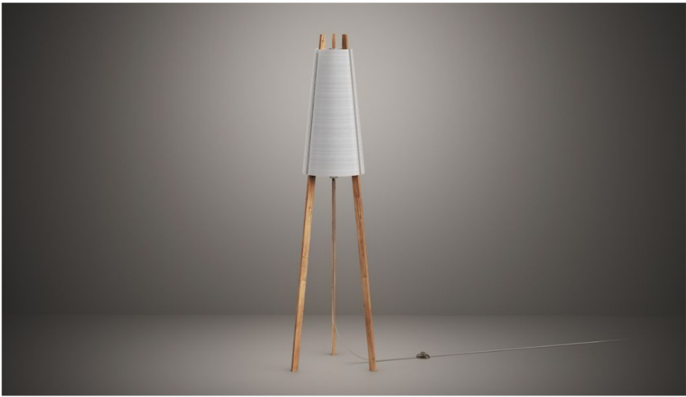
The 3-Point Floor Lamp has elements of mid-century modern design and features a 3D printed PLA shade built onto a tripod of sustainably sourced hardwood legs.