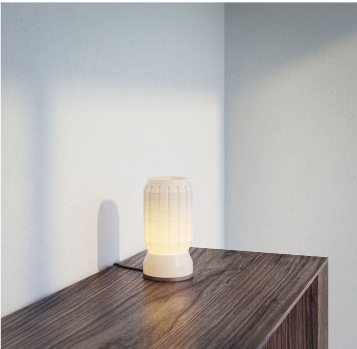
Eos Fluted Table Lamp

The Eos series includes five different table lamps, each with its own unique shape but created with the same translucency and opacity. The lamps can stand on their own as independent fixtures or grouped together as a family as they share similar form, scale, and negative spaces.