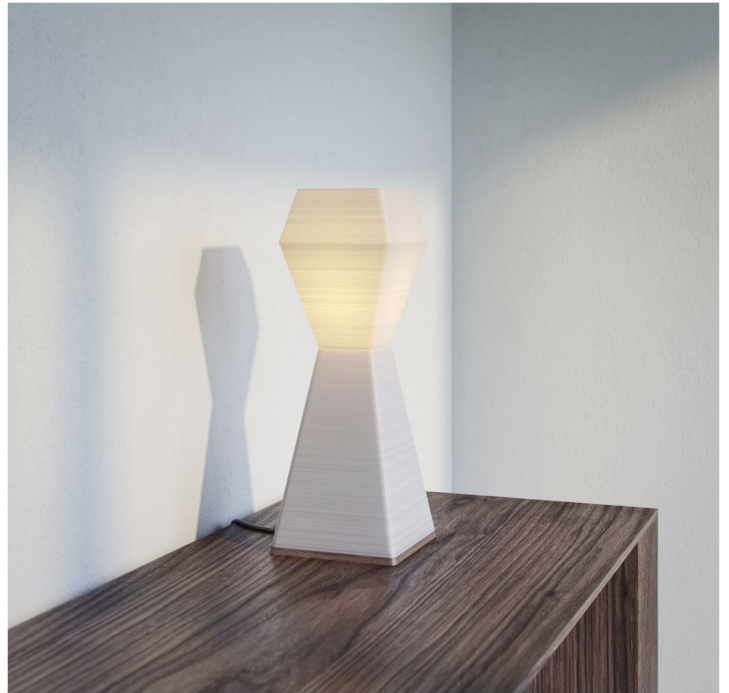
Eos Beacon Table Lamp